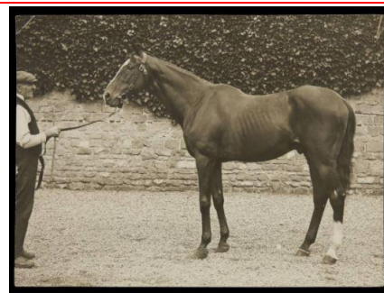
Carbine in London

THE OFFICIAL NEWSLETTER OF THE CARBINE CLUB