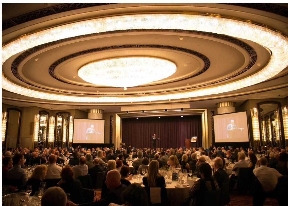
The Grand Hyatt Hong Kong – Carbine Club Racing Luncheon 2017

The Carbiner is now also available on the new Club website at www.thecarbineclub.org