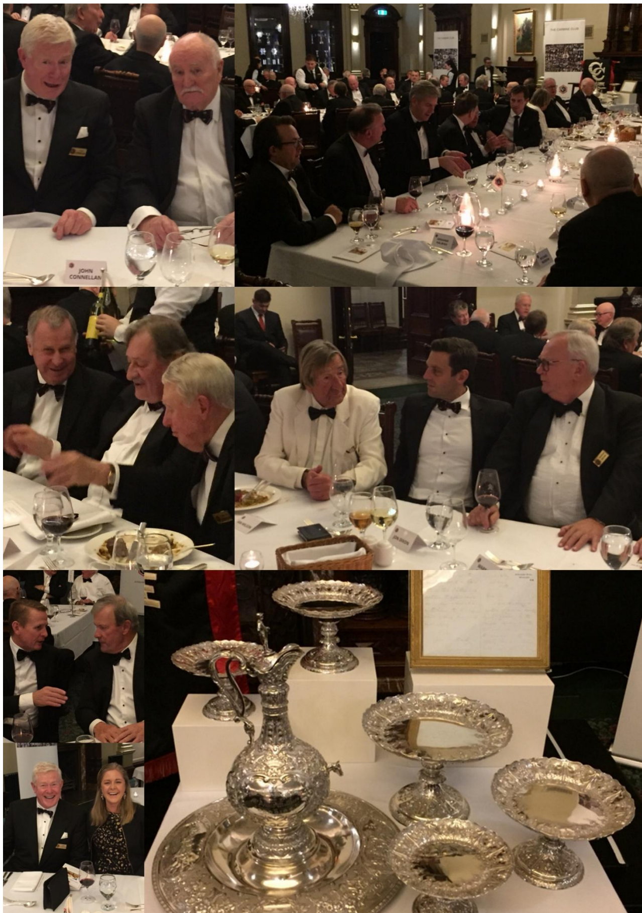
Annual Dinner